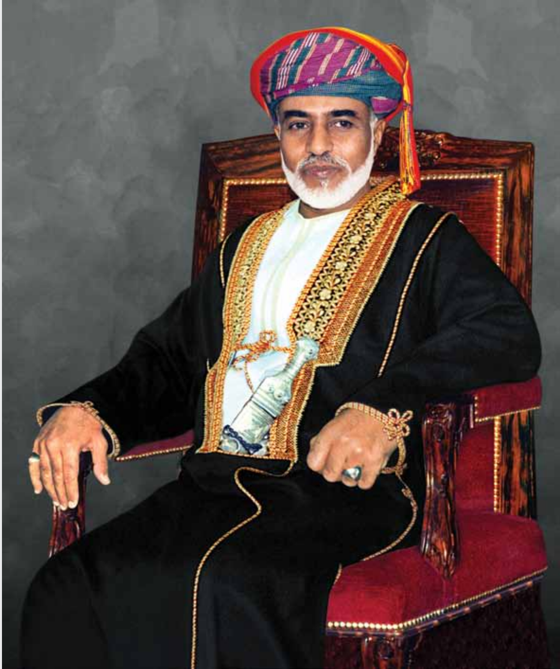
His Majesty Sultan Qaboos bin Said